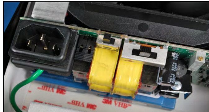
Figure 3. 220 Volt Jumper Setting