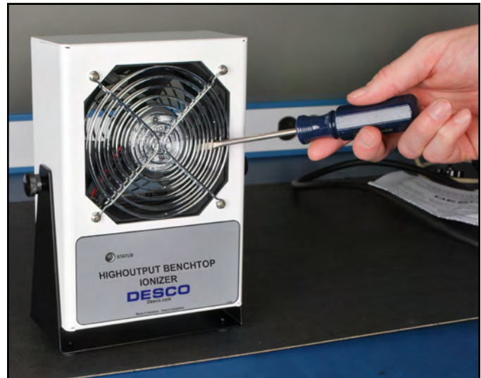
Figure 7. 60505 Shorting the Ionizer's two fan grills

There are no known health risks associated with our devices. The emitters work at about 4-6 kV and can create ozone, but there have been no significant measurement of ozone from our emitter sets as all our existing units test well below the OSHA limit of 0.05 ppm ozone. For additional safety information, see "Dispelling an Old Myth" written by William Metz of Hewlett-Packard published in Evaluation Engineering magazine September 2001.