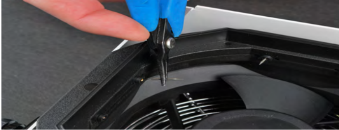
Figure 5 Cleaning the Emitter Points

In the event of circuit failure, the unit will enter shutdown mode. When the unit enters shutdown mode, ionization will be stopped, the LED on the front of the unit will illuminate a constant red, and the audible alarm will continuously sound. The user must then reset the unit by turning it OFF and back ON.