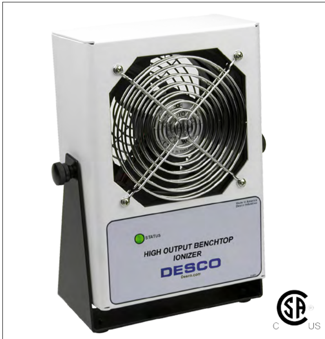
Figure 1. 60505 High Output Benchtop Ionizer