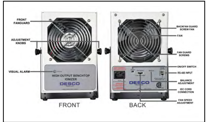
Figure 4. Front and Back High Output Benchtop Ionizer

Set the fan speed switch on the rear of the unit to the LOW, MED, or HIGH position. Higher airflow will result in faster discharge times. Position the unit so that the maximum airflow is directed at the items or area to be neutralized. Turn the unit ON. When the unit is first turned on, it will conduct a self-test. The audible alarm will sound and then the LED will cycle through RED, YELLOW, and GREEN. The LED will remain GREEN during normal operation.